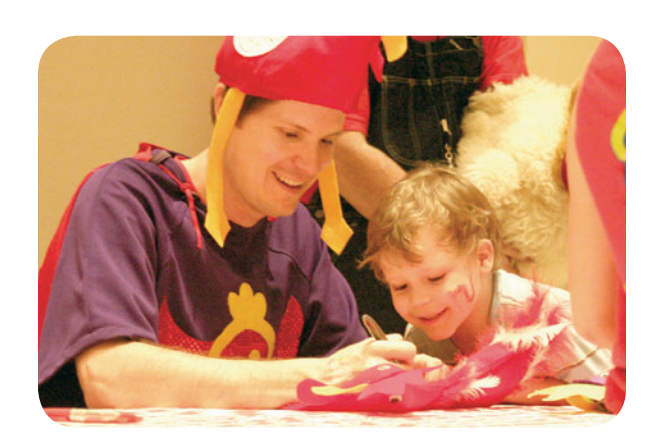
David & Mama Chicken always meet and greet guests to sign autographs after each performance